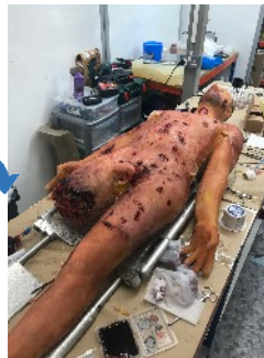
4) Final model (Sam 1.1) in action!