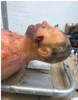
3) Bringing the model to life