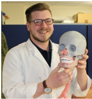
1) Each part custom made

The full body model Sam 1.1 which was configured for point-of wounding care after blast injury, is now finished and successfully trialled. This was part of an exciting project between Technovent, Trauma Simulation and PDR Surgical Design. Here is the timeline of the creation!